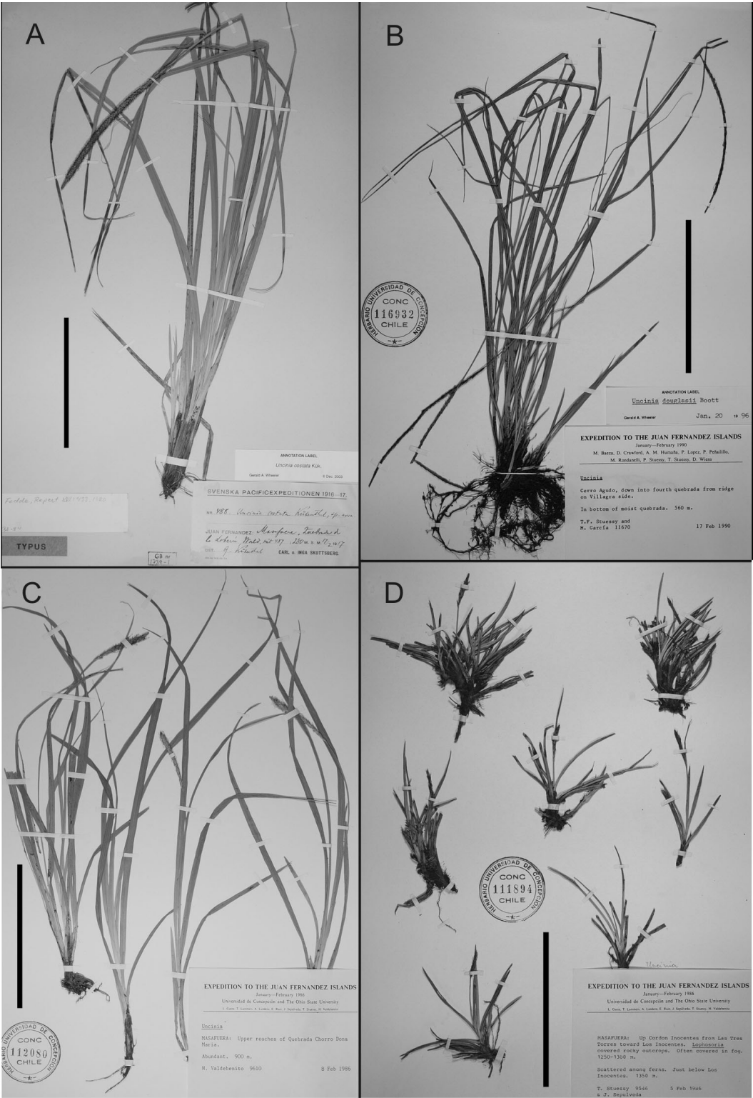
Fig. 3. Uncinia . A, U. costata . B, U. douglasii . C, U. aspericaulis . D, U. macloviformis . Bars = 10 cm.